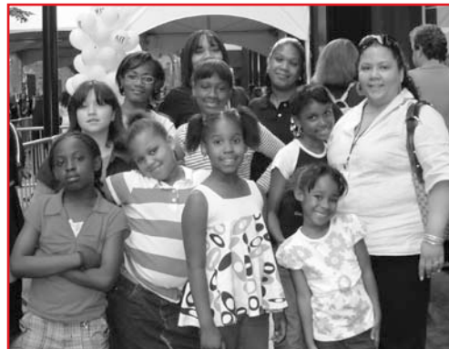
This group of children from the Women In Need homeless shelter felt like stars at the New York City premiere of “Kit Kittredge: An American Girl.”

Over 100 children from New Alternatives for Children, the Center Against Domestic Violence, Women in Need, Inc., The Osborne Association and the South Bronx Overall Economic Development Corporation walked the Ziegfeld Theatre's red carpet, along with Hollywood luminaries Jada Pinkett-Smith and Julia Roberts, an executive producer of