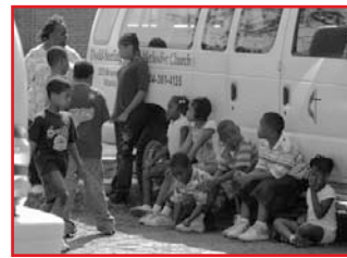
Kids from Atlanta’s Dodd-Sterling United Methodist Church wait for the shoe giveaway. Both kids and adults stood in line for new flip-flops and gym shoes distributed by Soles4Souls during Barefoot Week.

Charities in New Orleans and the Northern Arizona Food Bank in Flagstaff – thereby make the summer a more enjoyable and productive one for them.” ●